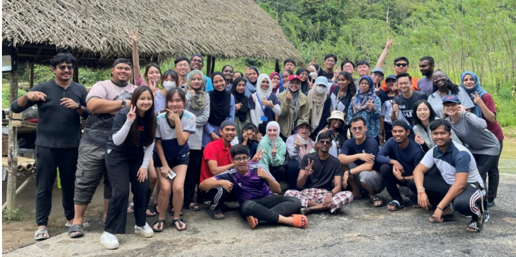
Second Medical Outreach Camp at Kampung Beswok & Kampung Kotai, Perak