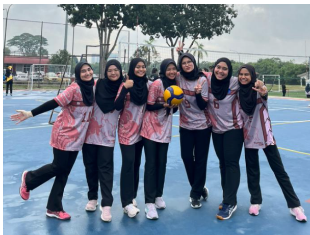
MAHSA MBBS students Volleyball Team