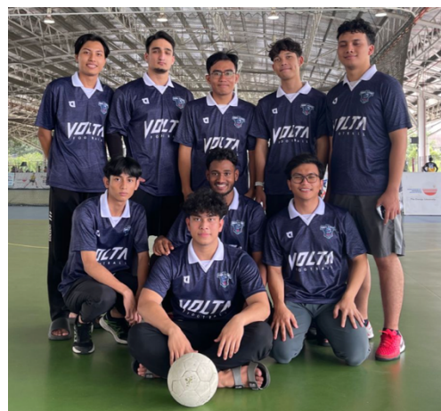
MAHSA MBBS students Futsal Team