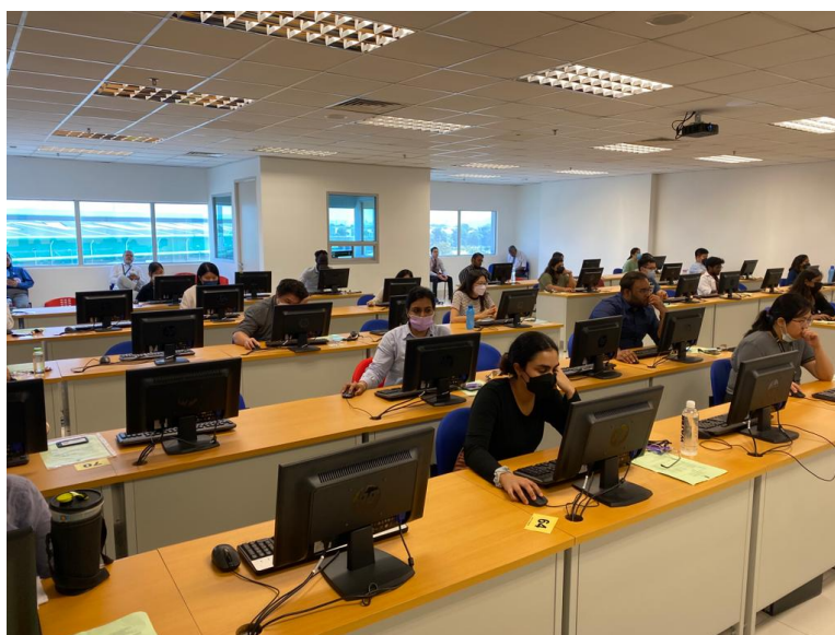
Conduct of Theory Exams via Learning Management System (LMS)

All three professional exams were conducted successfully with positive feedback from all external examiners. Their suggestions were taken into considerations for improvement of future exams.