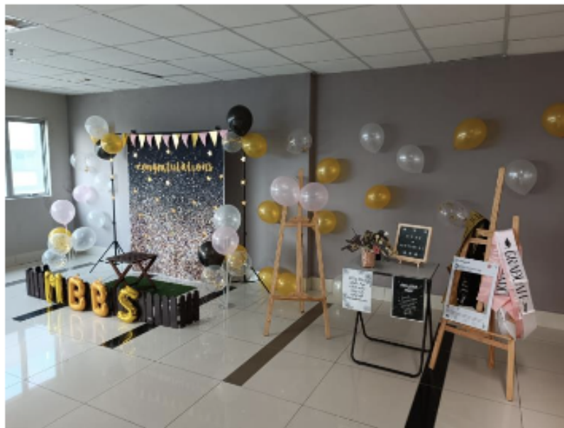
Photo Booth Set Up at the Homecoming Event

The School of Medicine (SOM) homecoming event in 2022 was organised on the 24th of November 2022 at the auditorium, level 9, Empathy Building, MAHSA University, from 11.00 am to 1.00 pm.