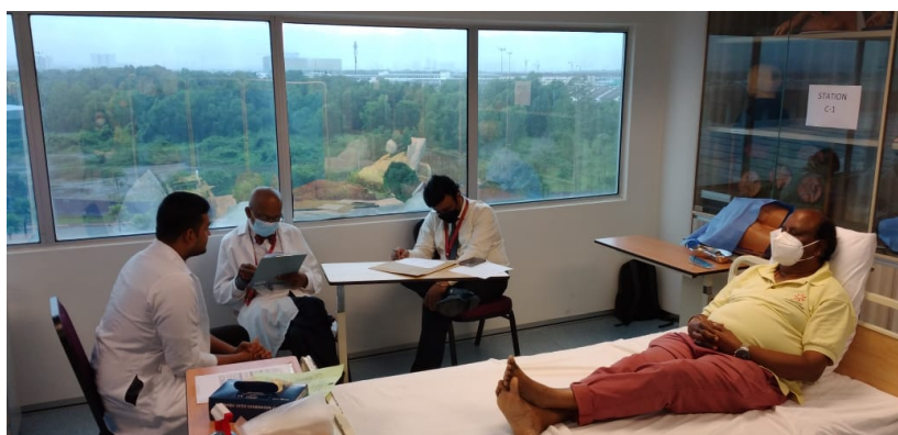
Conduct of i-OSCE in Clinical Skills Lab, SPC, MAHSA University